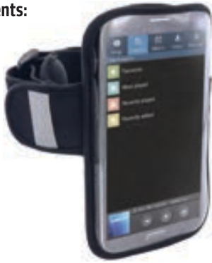
ARBAND6 Workout Armband for Smartphones up to 6.3" screen Size or 6.5" Height