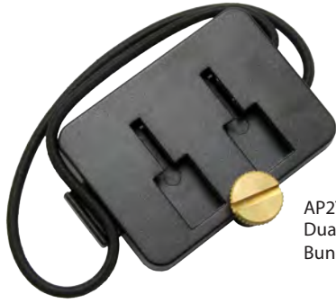
AP2TSTRAP Dual T-Slot to Dual T Tab with Bungee Locking Strap