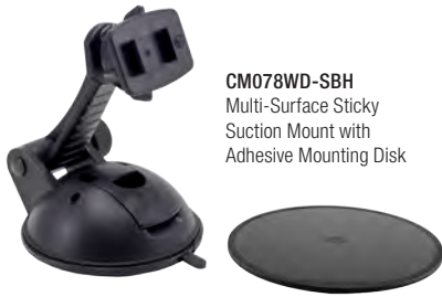
CM078WD-SBH Multi-Surface Sticky Suction Mount with Adhesive Mounting Disk