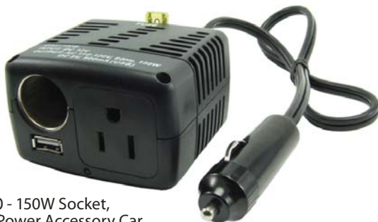
CADAU-150 - 150W Socket, USB & 12V Power Accessory Car Lighter Socket adapter