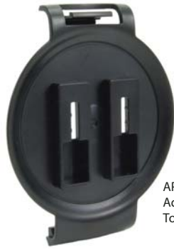
APTTSE Adapter Plate for TomTom Start™ & Ease™