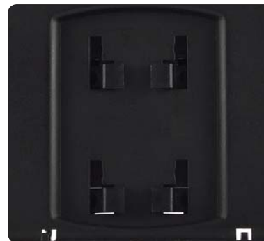
4-Prong Euro cradle (front) with adapter attached.