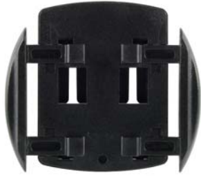
AP031 Dual T-head to 4-Prong Euro adapter plate

(Shown with adjustment arms in open position)